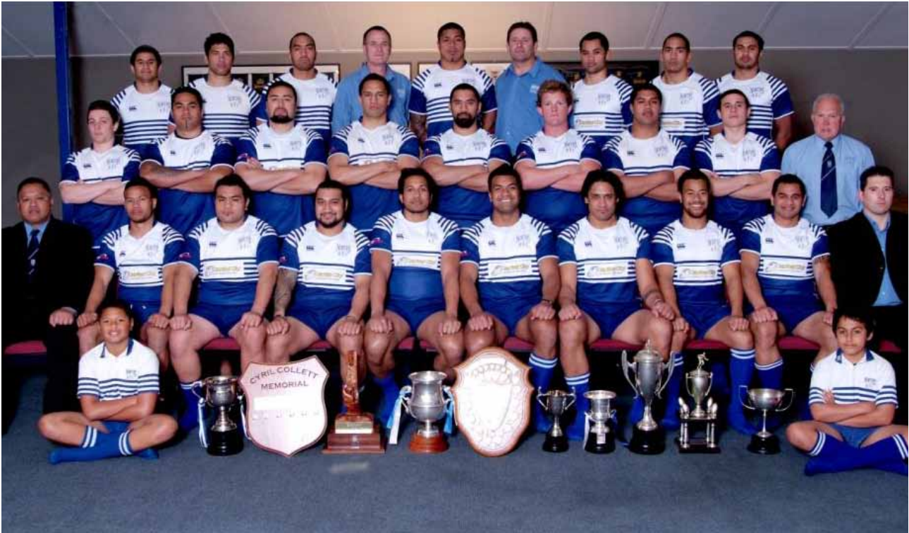
NORTHERN UNITED RUGBY CLUB PREMIER MEN'S