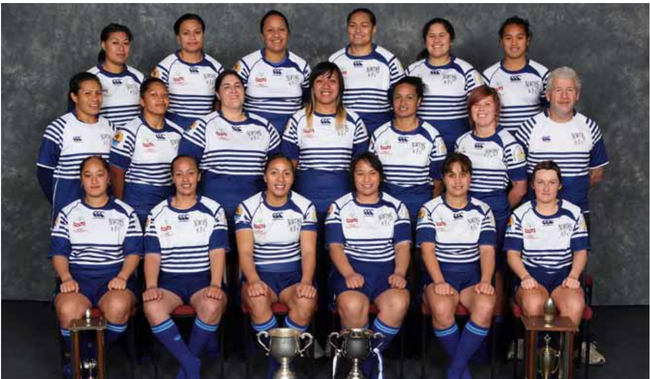
NORTHERN UNITED RUGBY CLUB PREMIER WOMEN'S